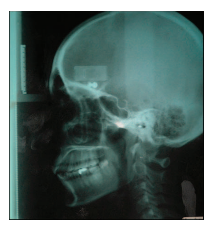
Figure 1. Radiograph taken in the natural head position. A 0.5-mm wire was adopted on the fluid level device to represent the true horizontal, and the vertical chain can be seen clearly.

gender. Because craniofacial features such as size, shape and form, and facial pattern will show variations in different genera, races, and subraces, normative data should be maintained for each racial group. Therefore, knowledge of normal dentofacial patterns of each ethnic group has much importance.